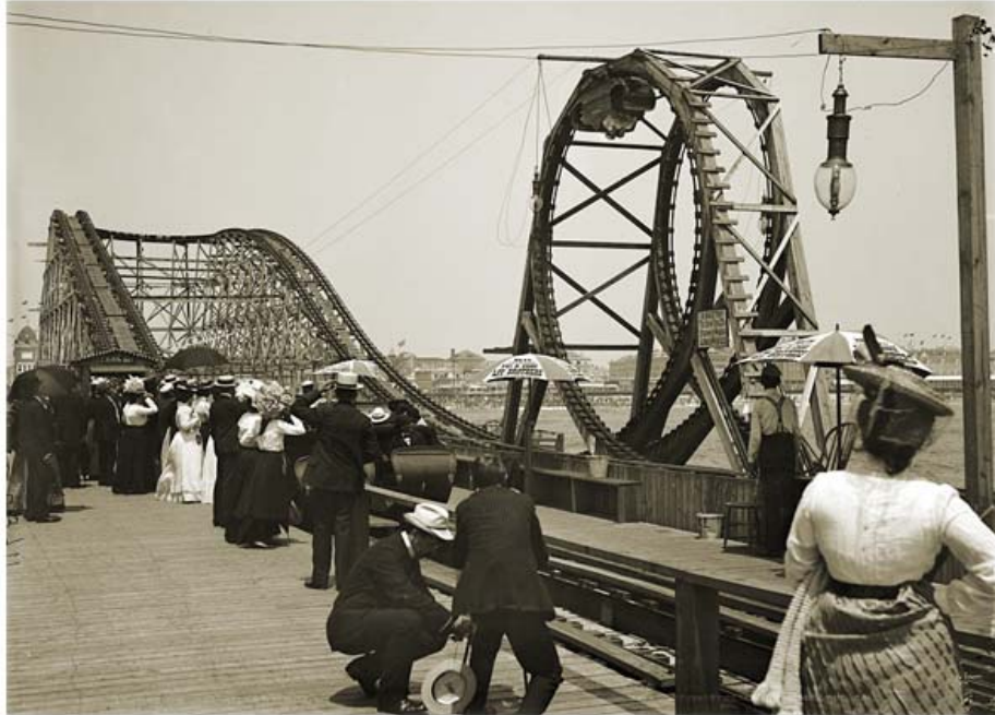
Flip-Flap Railroad AKA Looping-the-Loop, c. 1902