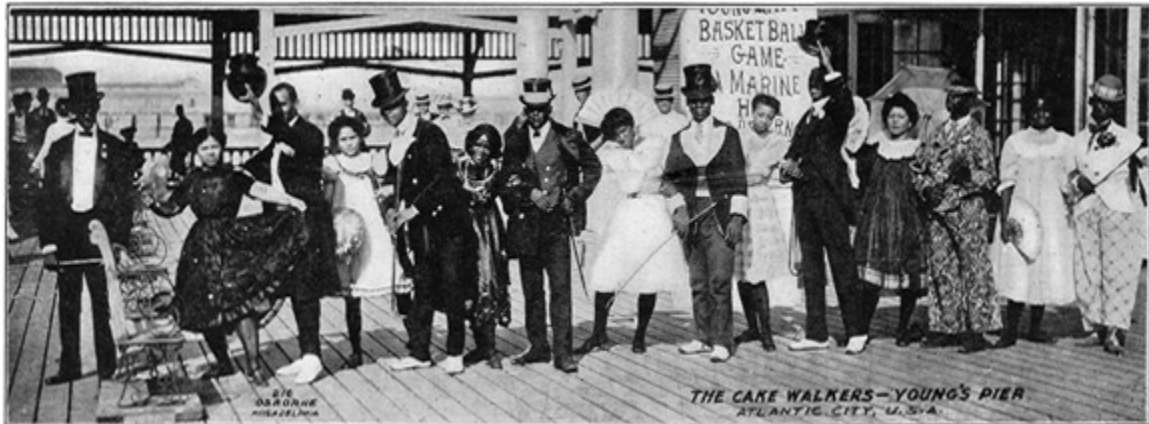
Entertainment like the renowned Cake Walkers delighted the public.

To attract more crowds, the two installed an aquarium, ballrooms, and booked regular band concerts. Vaudeville show performances were given in the pier's theatre.